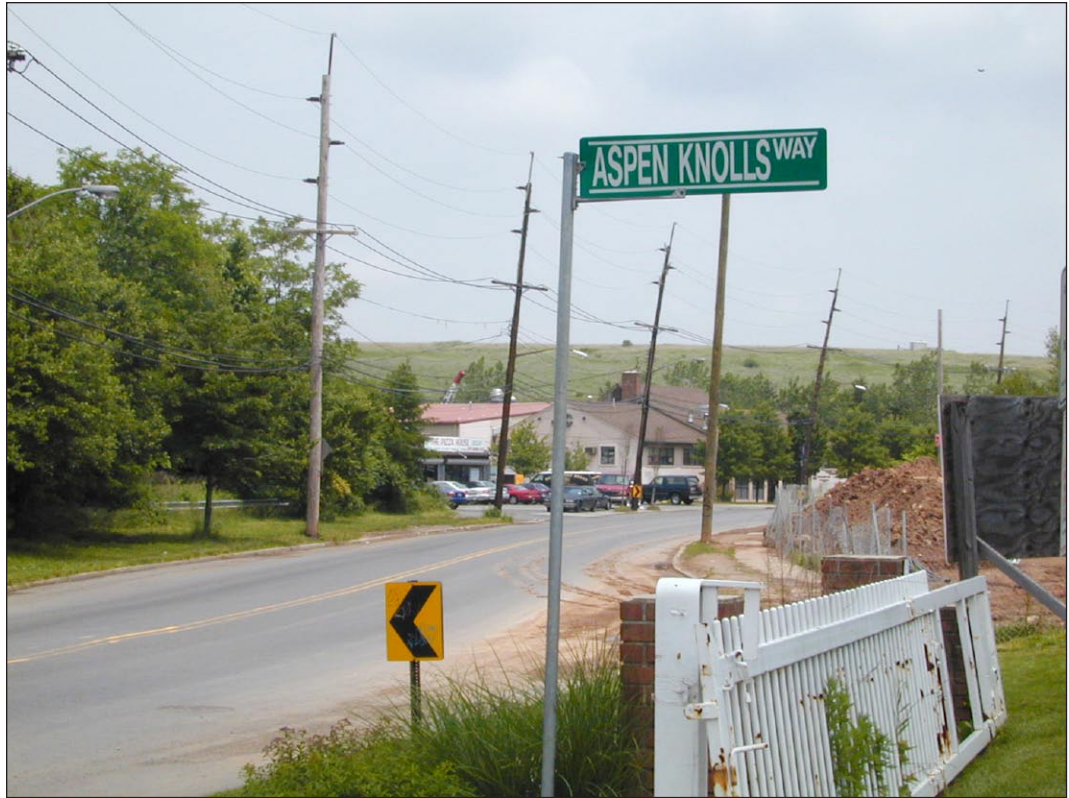
Arthur Kill Road at Aspen Knolls Way 24