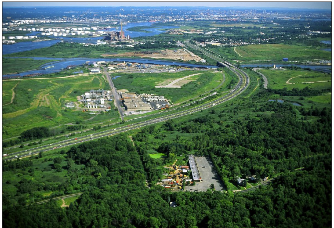
Building "clusters" 8