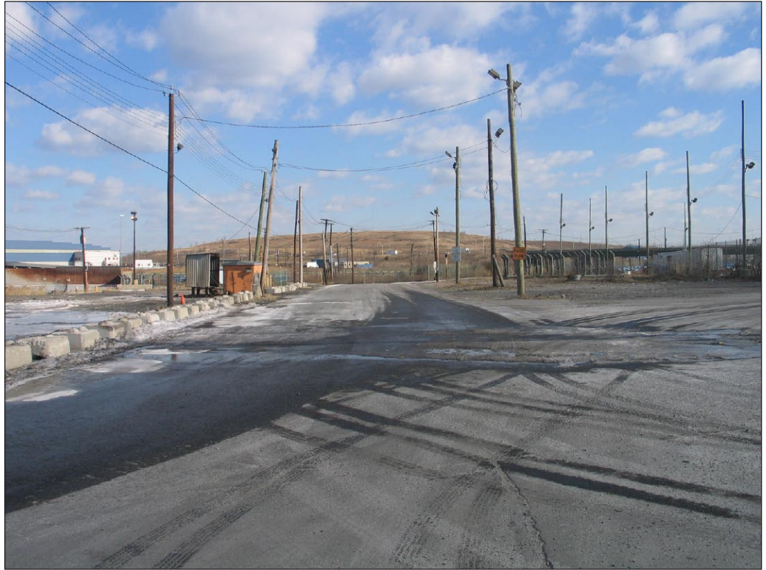
Paved road 3