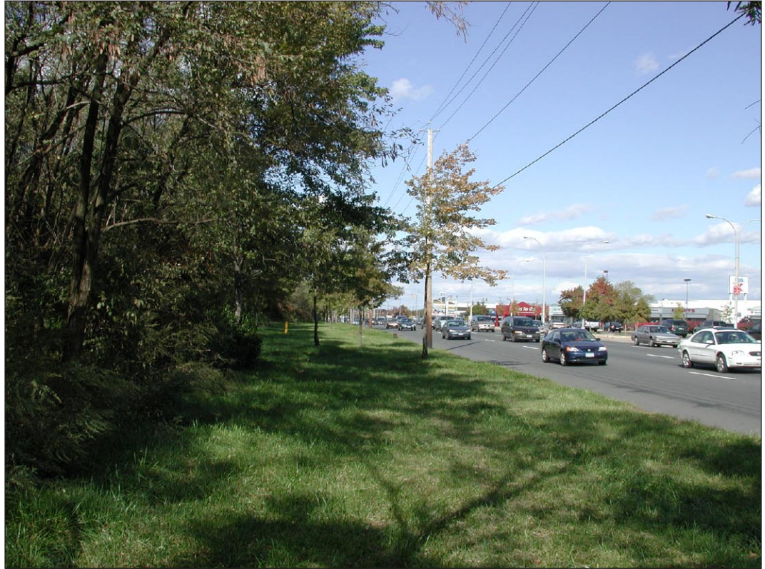
Planted berm along Richmond Avenue 37