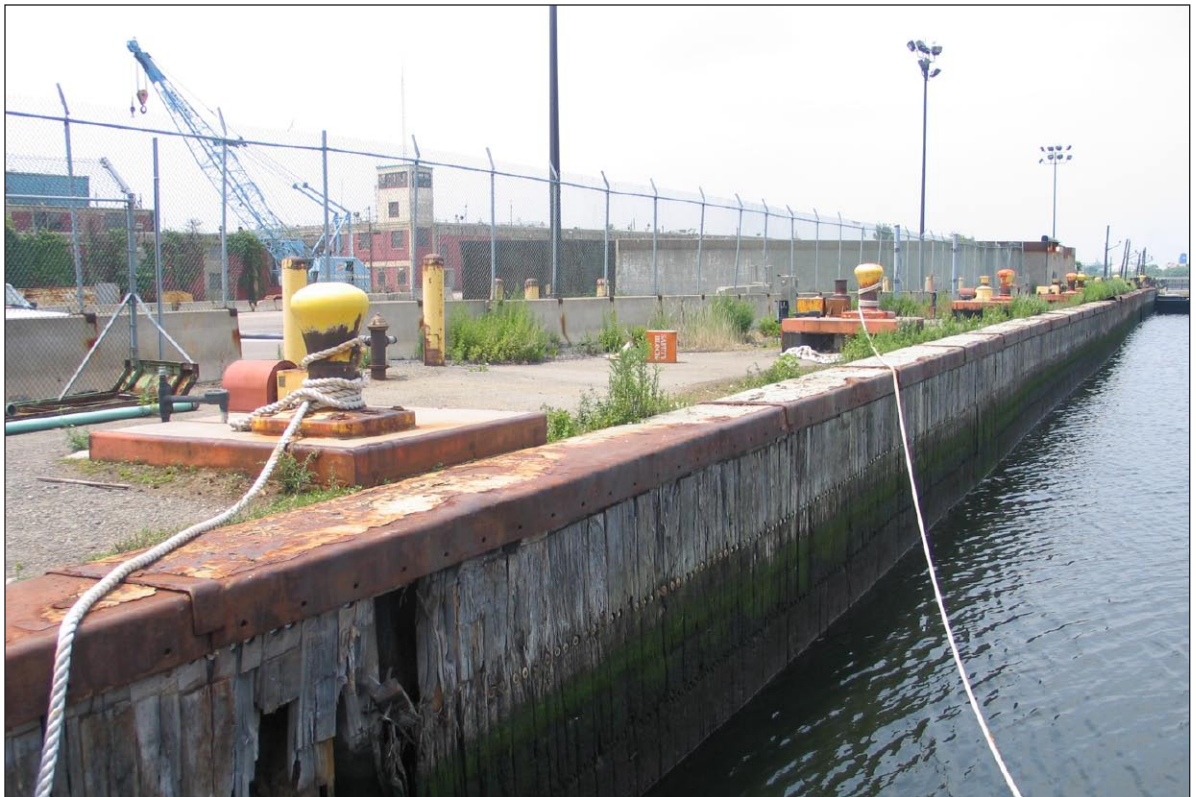
Bulkheads at Fresh Kills 13

Urban Design - Project Site Building Uses, Shapes, and Forms Figure 8-7