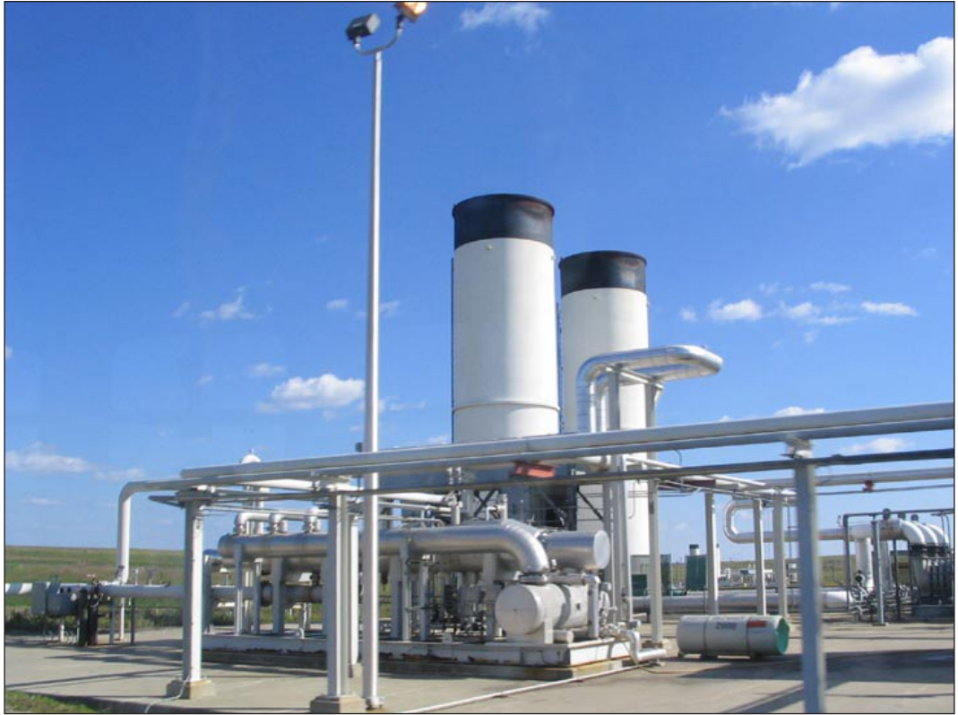
Flare Station, Landfill Section 3/4 9