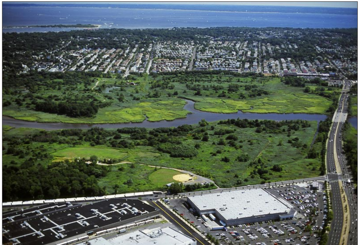
La Tourette Park, south of Staten Island Mall 36