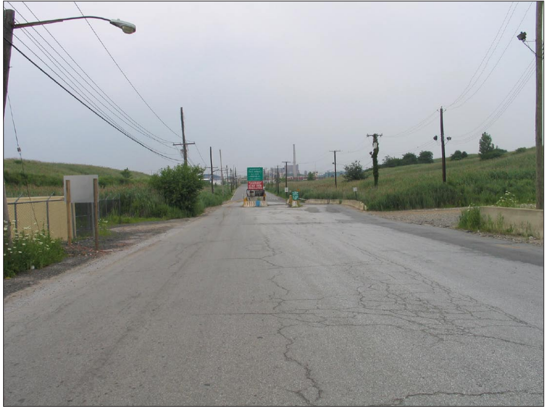
Entrance check point at Muldoon Avenue 5