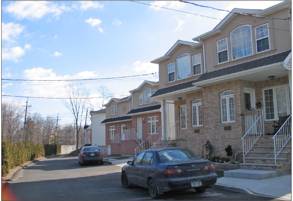
Cul-de-sac in Arden Heights 19