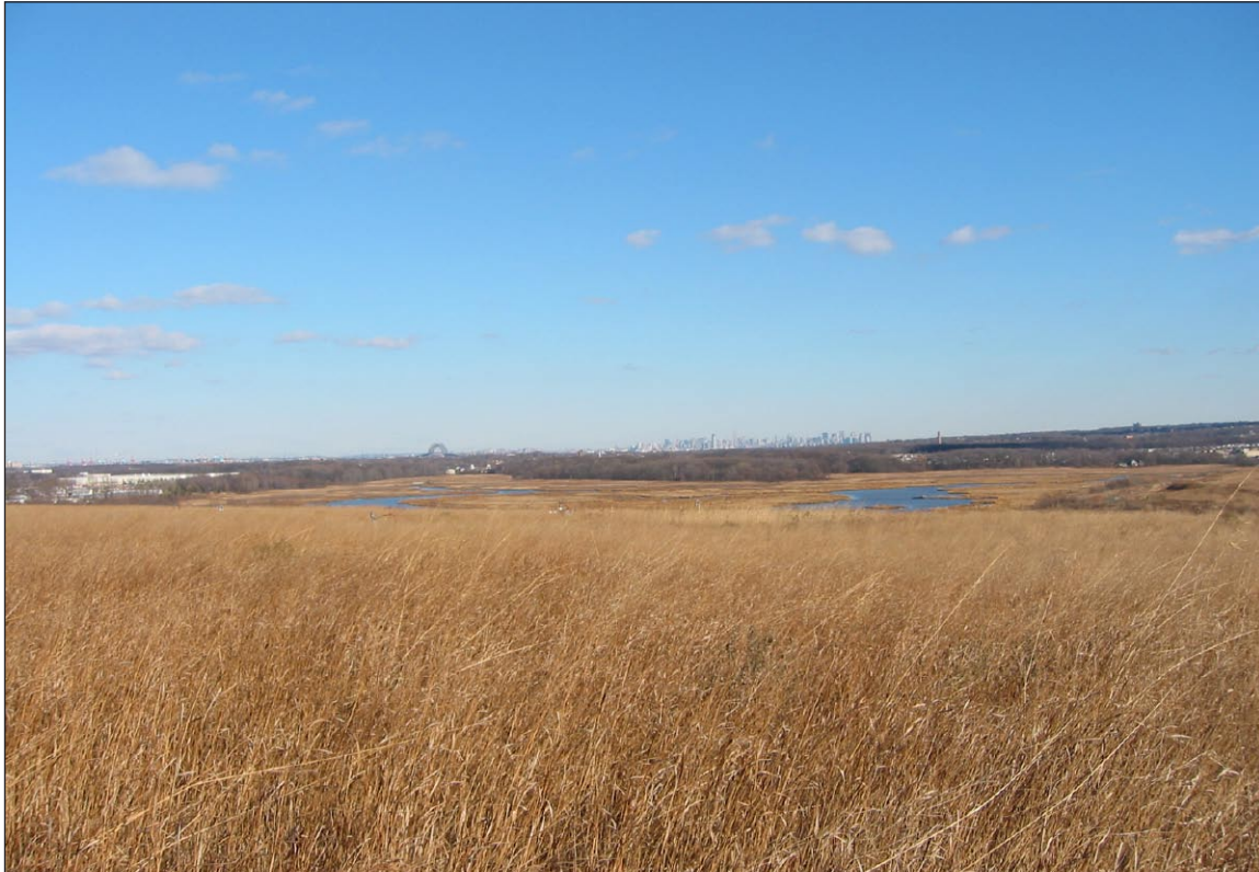
View north from Landfill Section 6/7 16