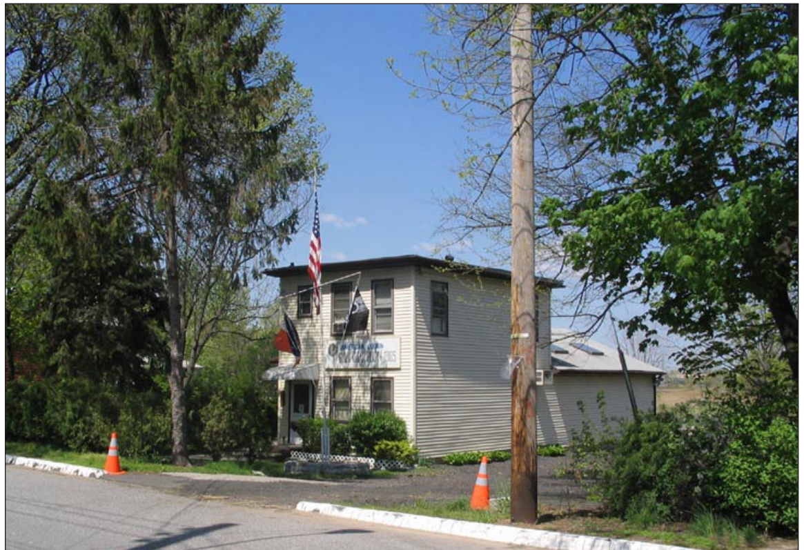
Meeting hall in Travis 33