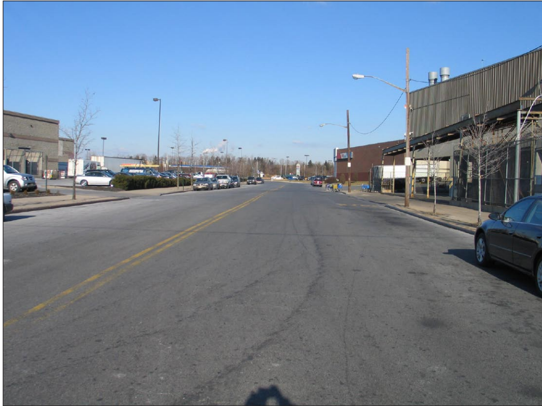
Independence Avenue, through the Staten Island Mall shopping strip 27