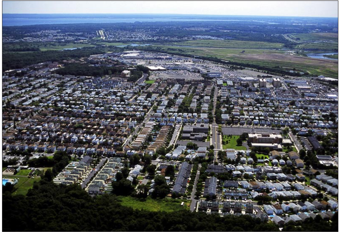
Yukon Avenue, through the Staten Island Mall shopping strip 21