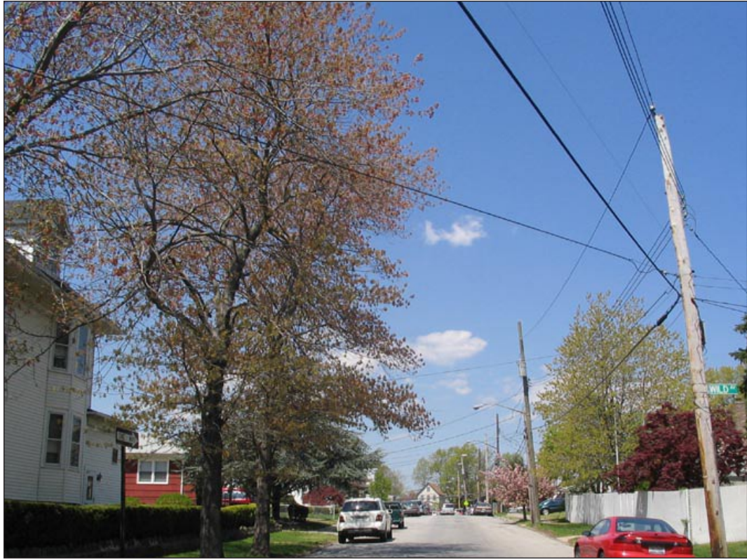
Victory Boulevard in Travis 34