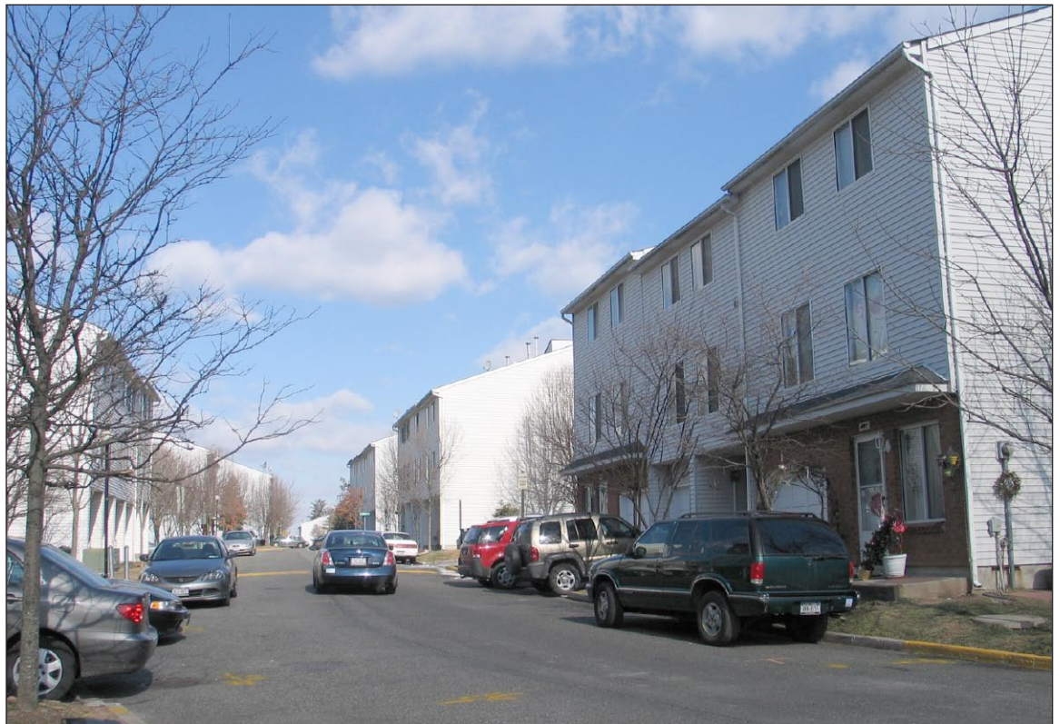
Condominiums in Arden Heights 29