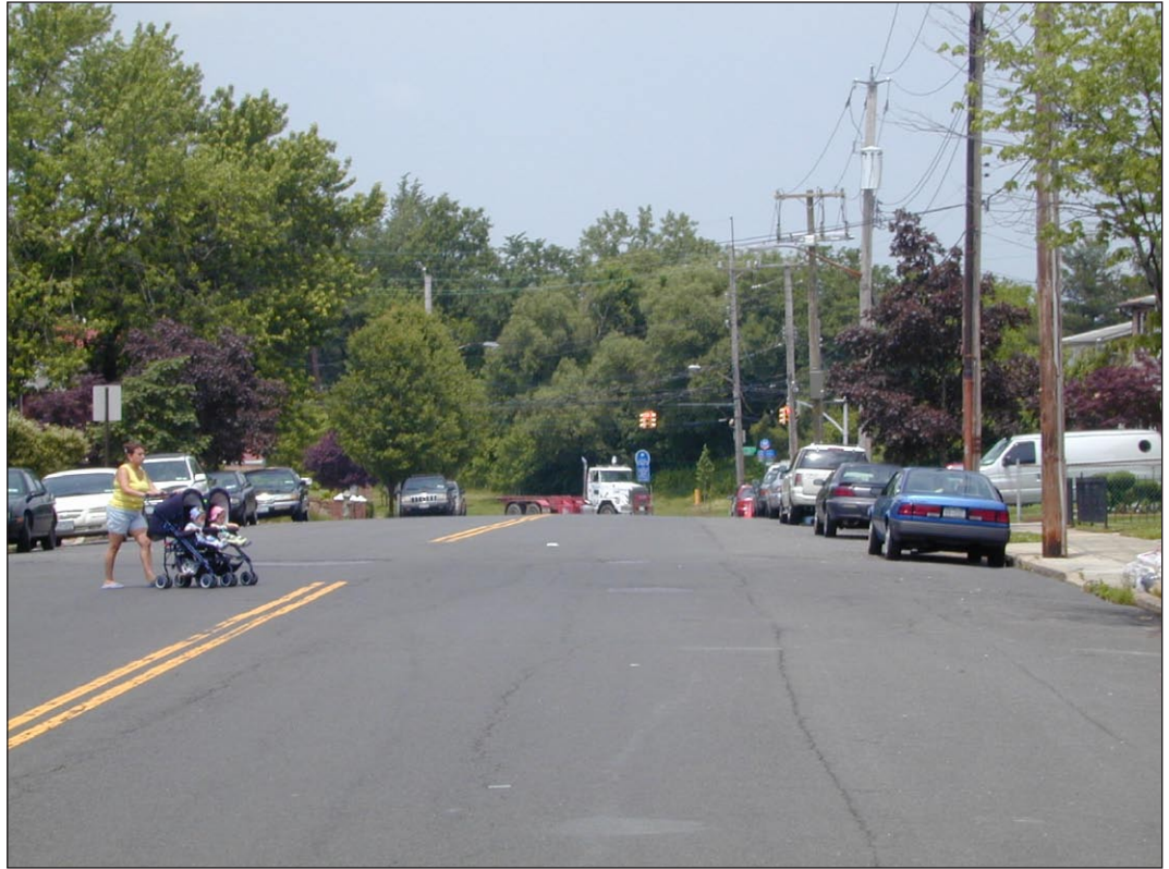
Older Arden Heights developments provide some pedestrian amenities 25