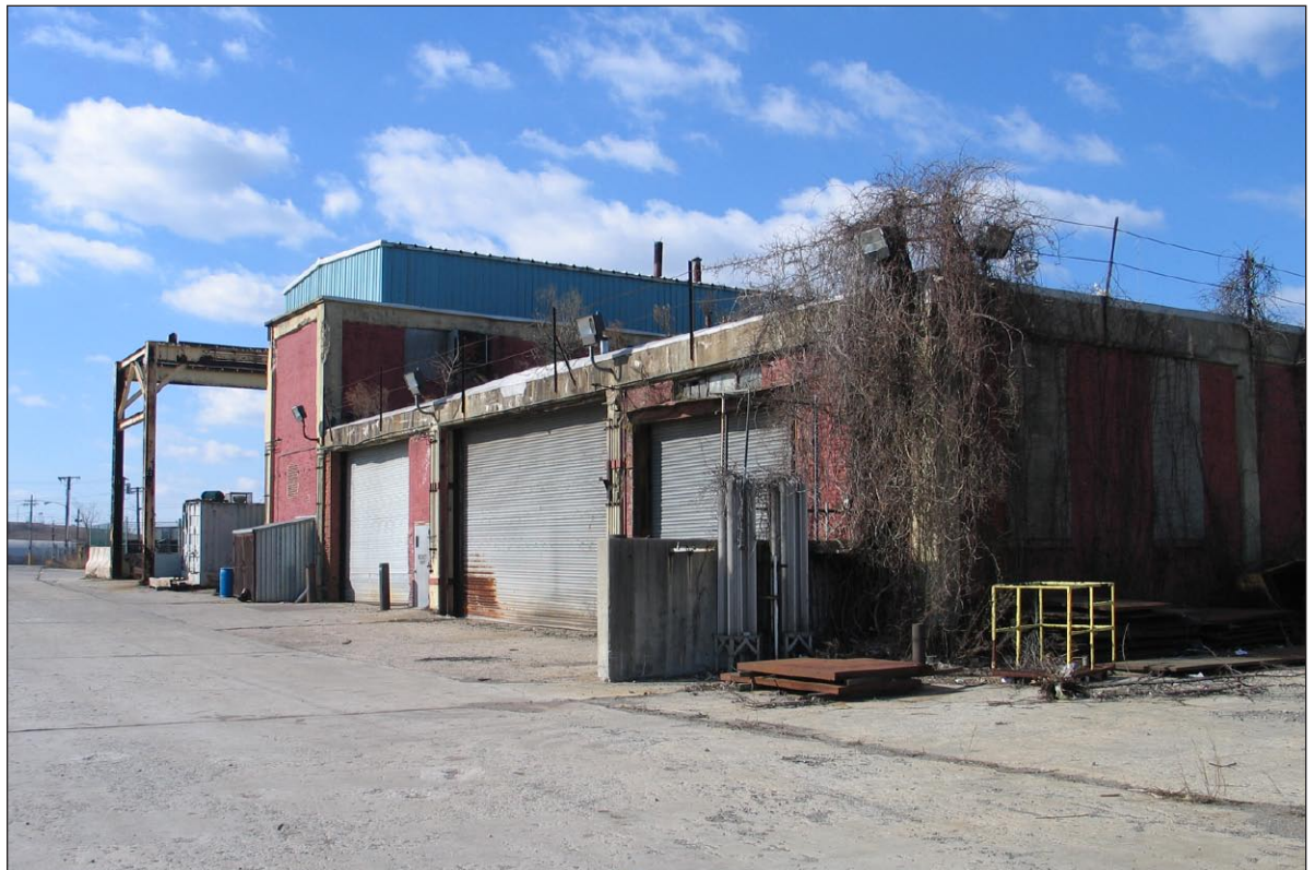
Underutilized and derelict buildings 11