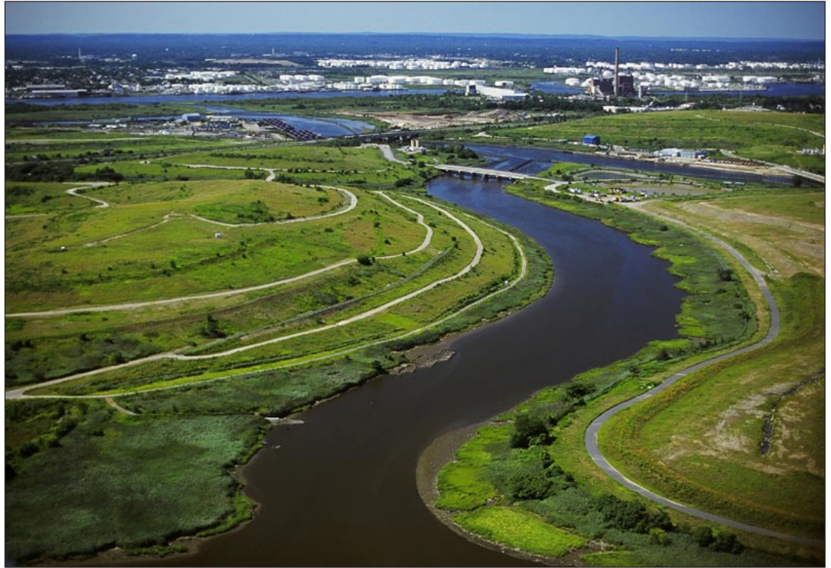
DSNY access roads traverse the site in response to mound shape 1