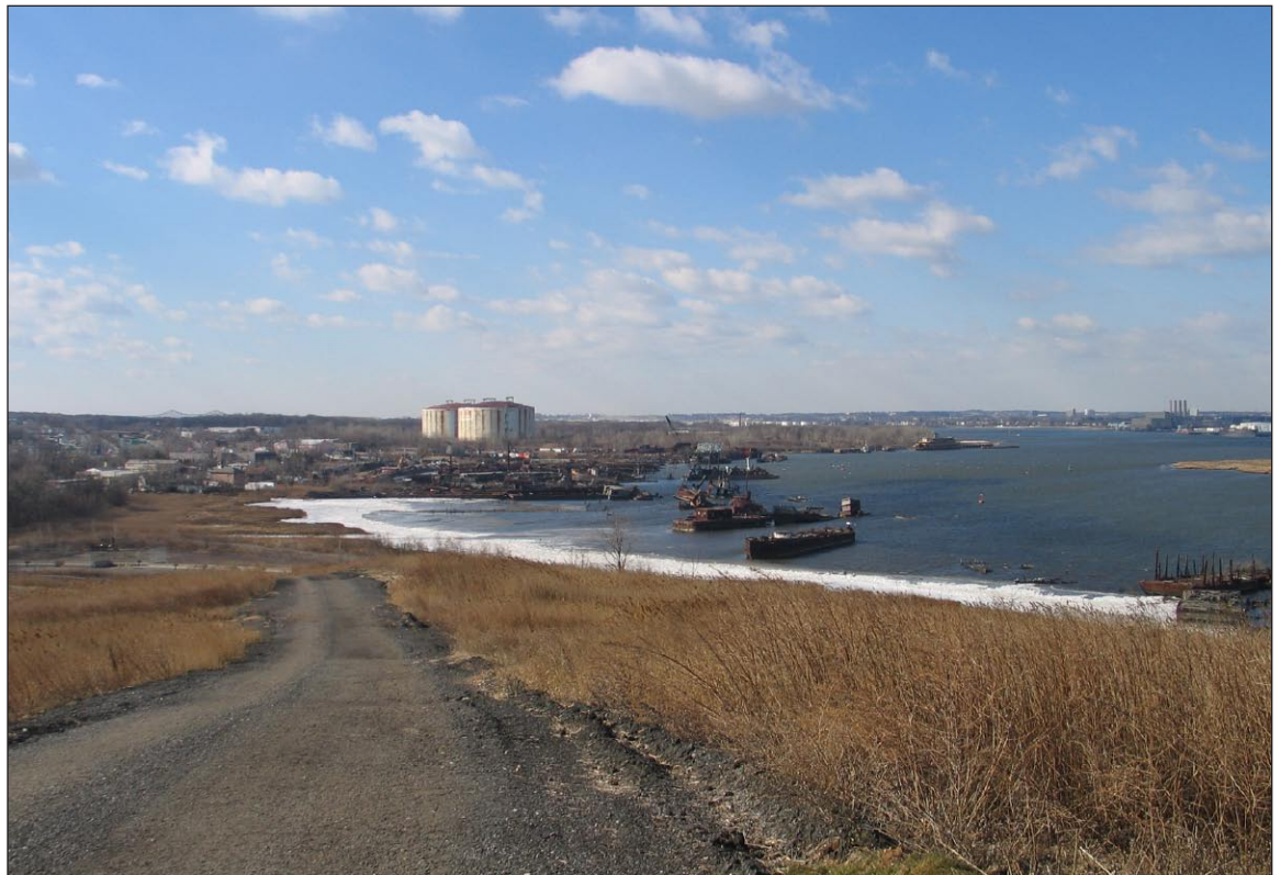
View southwest from Landfill Section 1/9 15