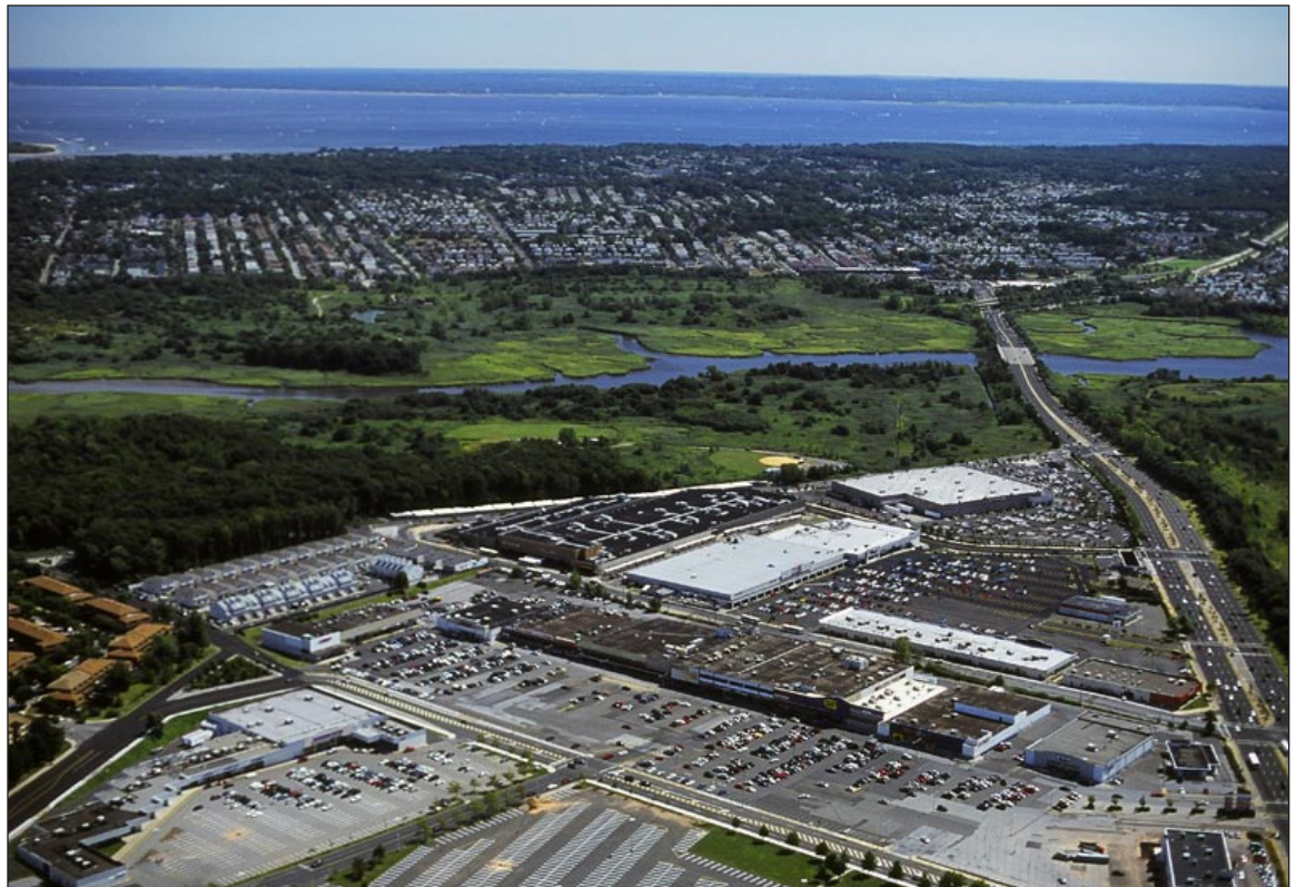
Commercial strip along Richmond Avenue 20

Urban Design - Study Area Natural Features, Street Patterns, Block Shapes Figure 8-11