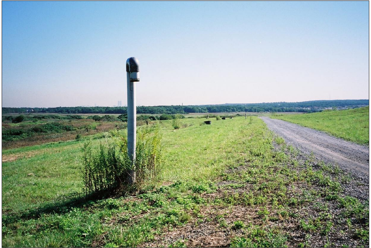
Above-ground infrastructure networks have a visual presence on site 12