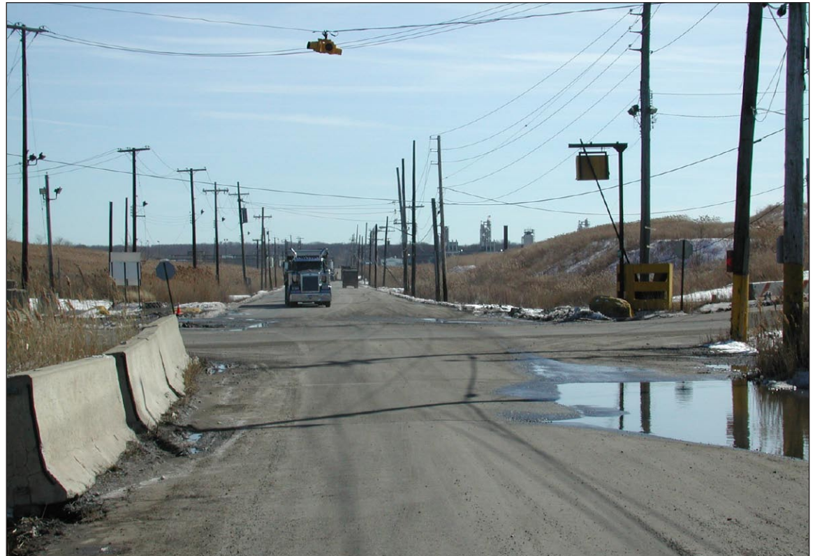
Utilitarian street layout 2