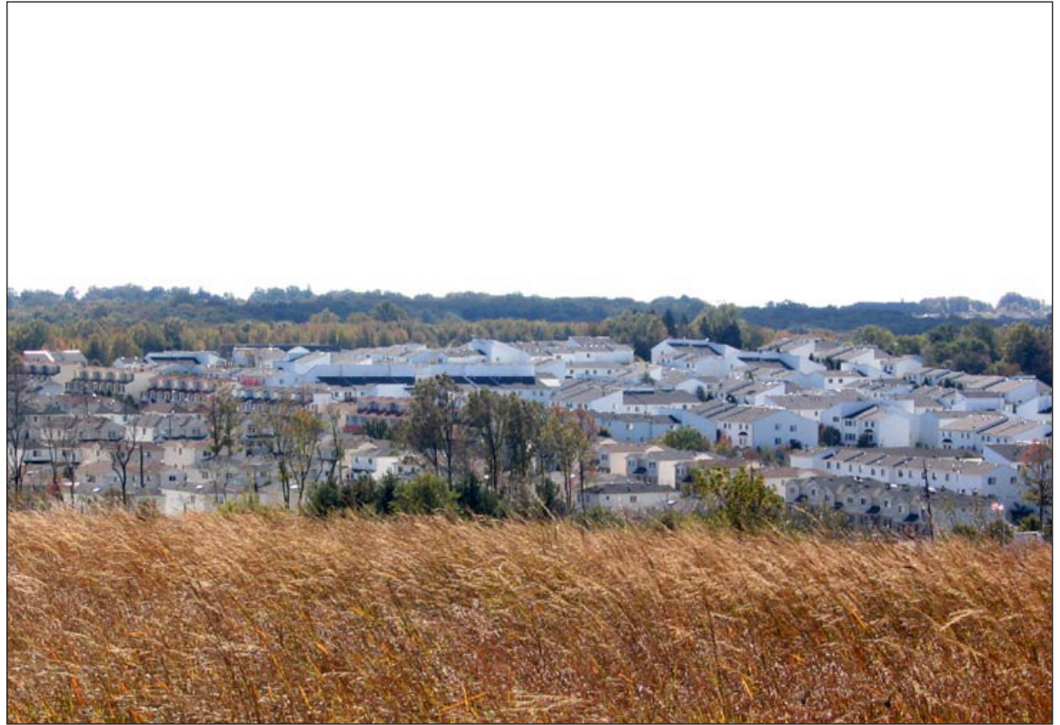
Arden Heights subdivisions as seen from Fresh Kills Landfill 28