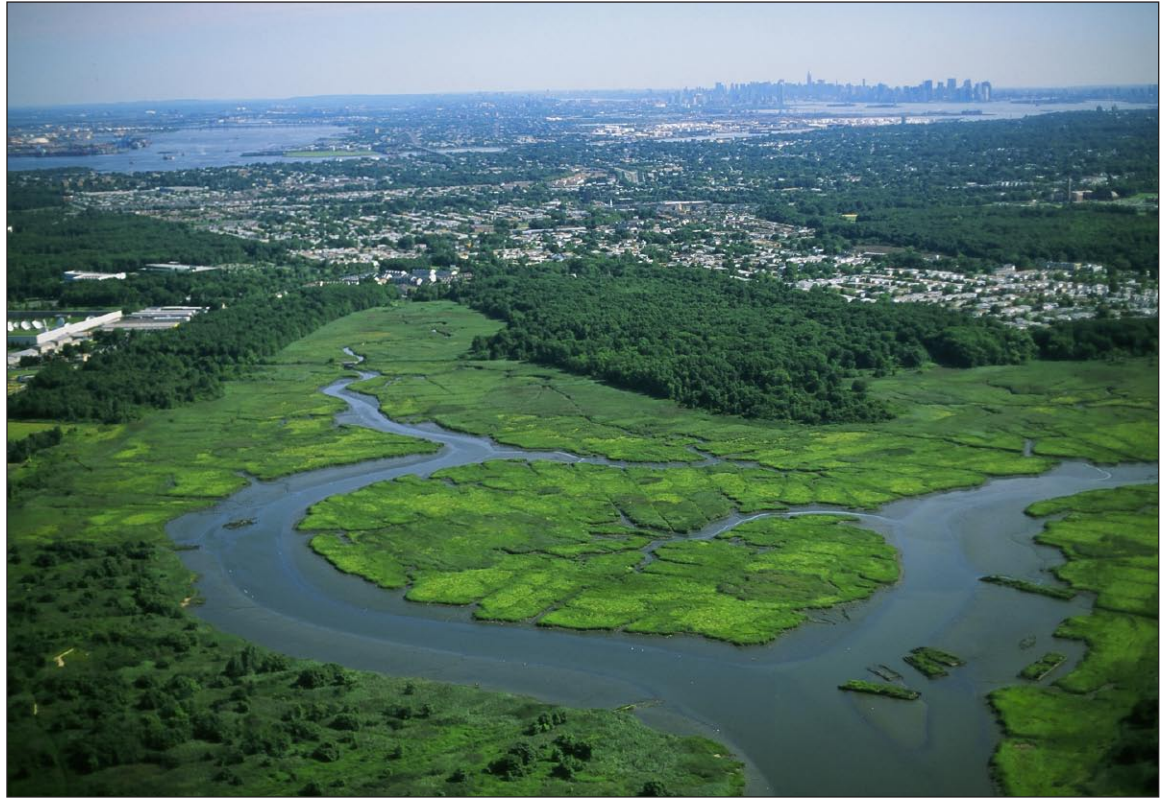
View northeast of William T. Davis Wildlife Refuge and the Manhattan skyline beyond 14