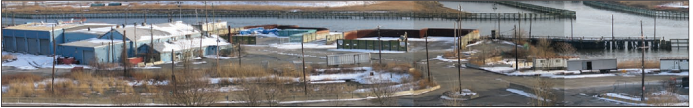
DSNY operations-related buildings on site 7