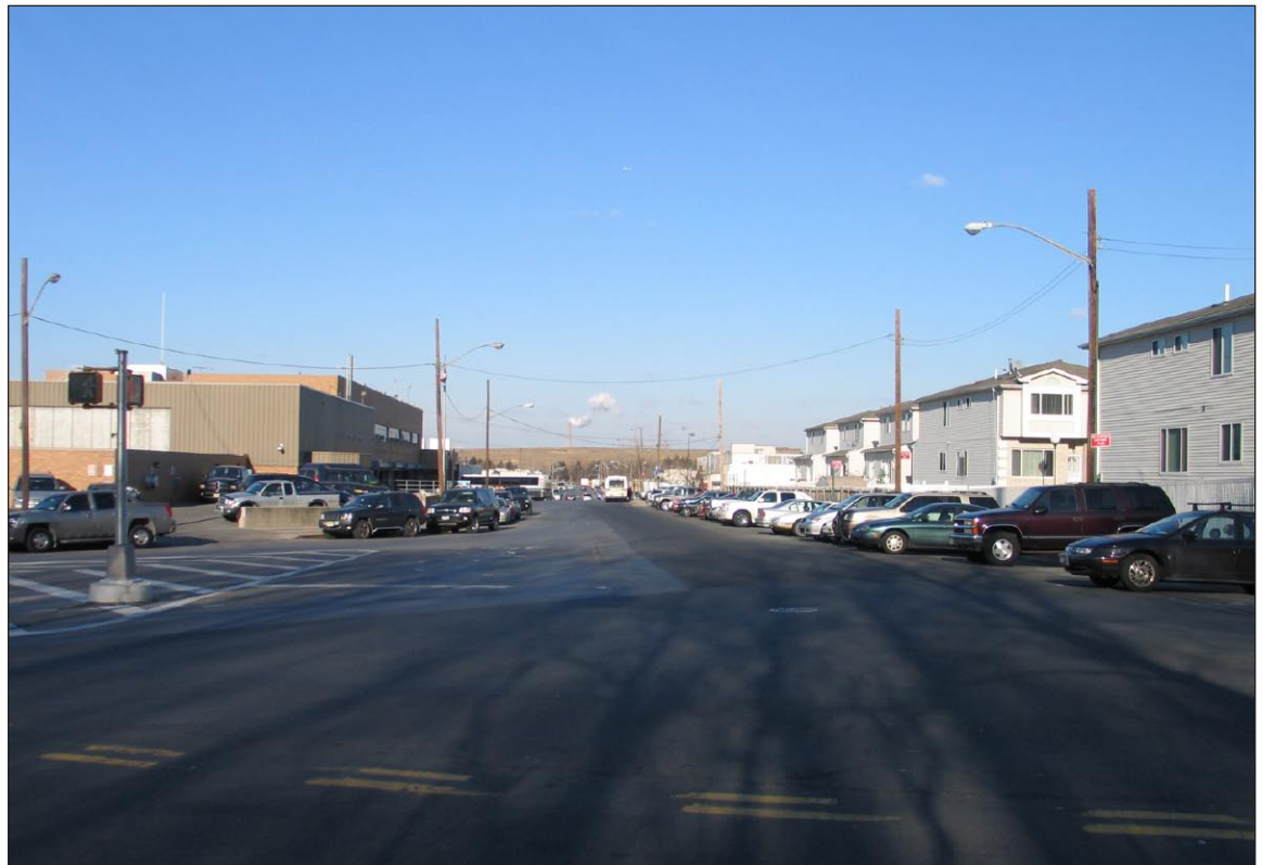
The regularized residential streets and blocks north of Staten Island Mall, in New Springville 22

Urban Design - Study Area Natural Features, Street Patterns, Block Shapes Figure 8-12