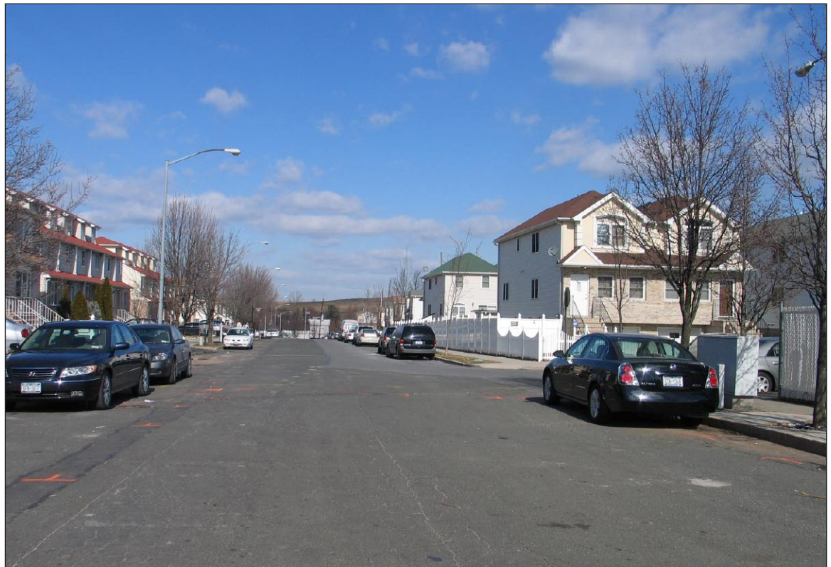
Street grid in Arden Heights 18