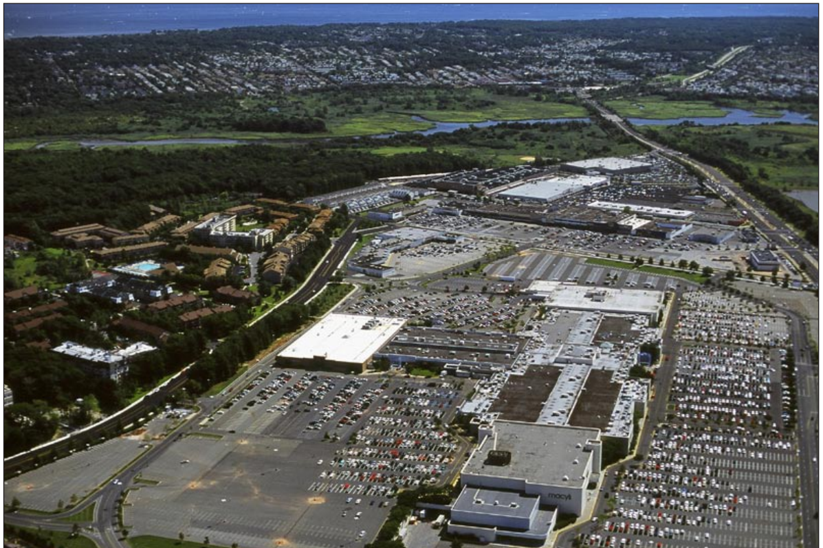
Big box retail on Richmond Avenue (right) and adjacent middle-rise condominiums 31