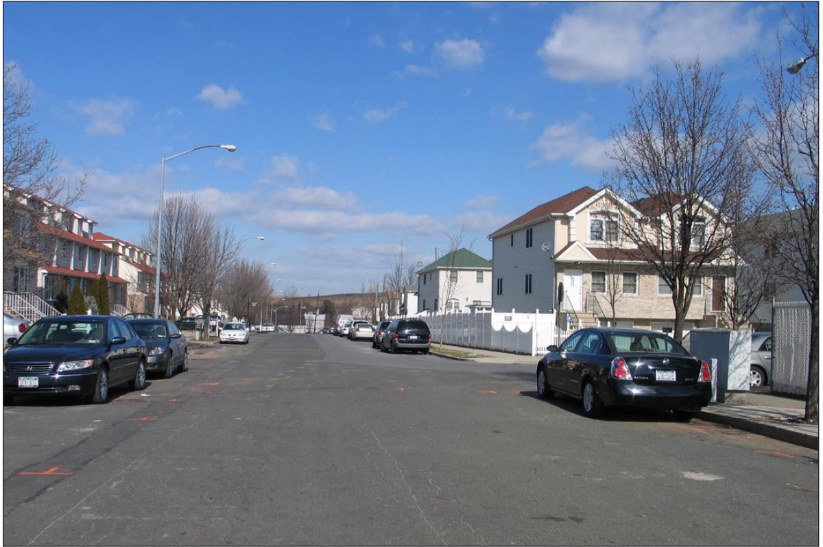
Detached, single-family homes in Arden Heights 30