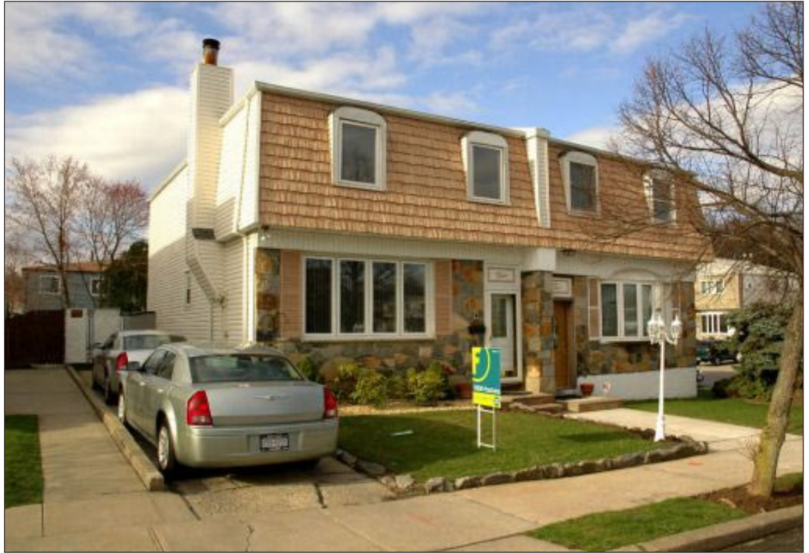
Single-family home in New Springville 32