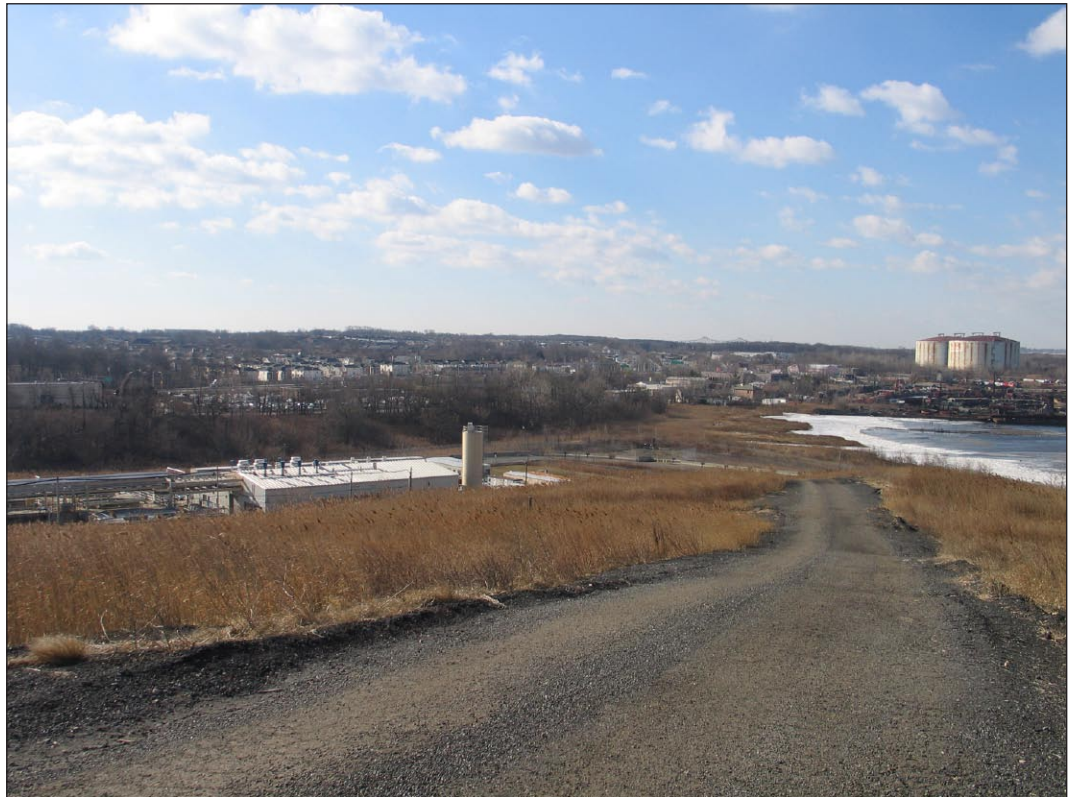
Unpaved truck route (view south from 1/9) 4