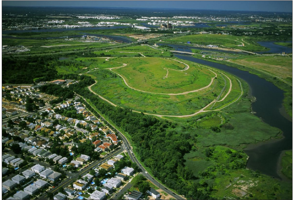
Arden Heights (lower left) residential areas are generally a rectilinear grid 17