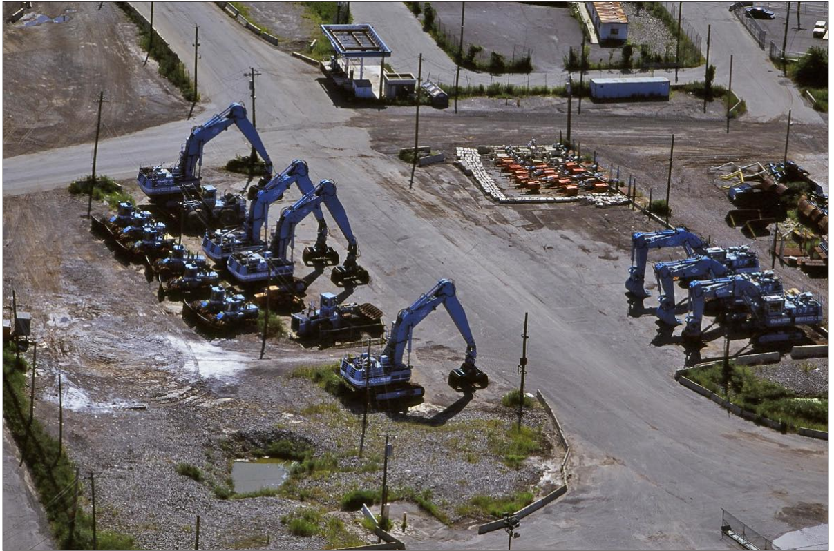
Former central area multi-use paved surfaces 10