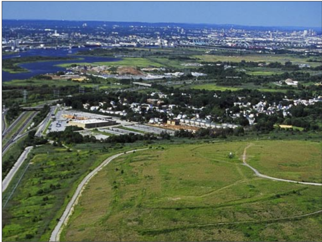
Travis neighborhood in middleground 23