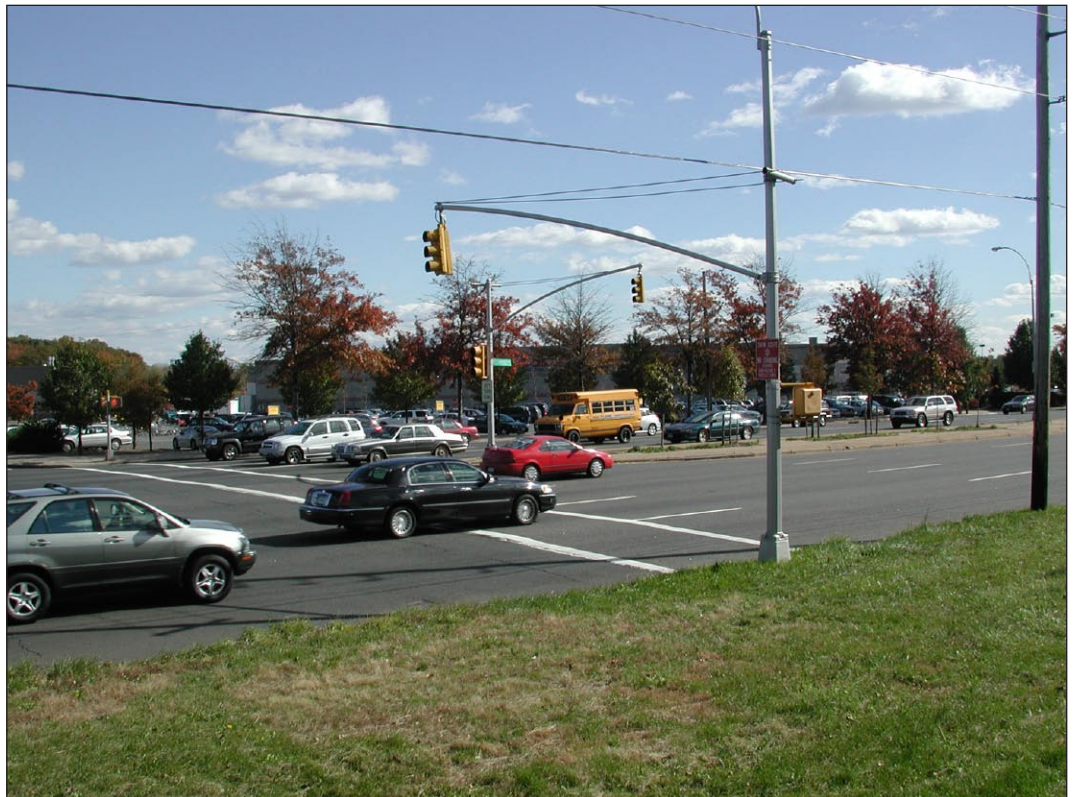
Richmond Avenue is a busy, wide street 26