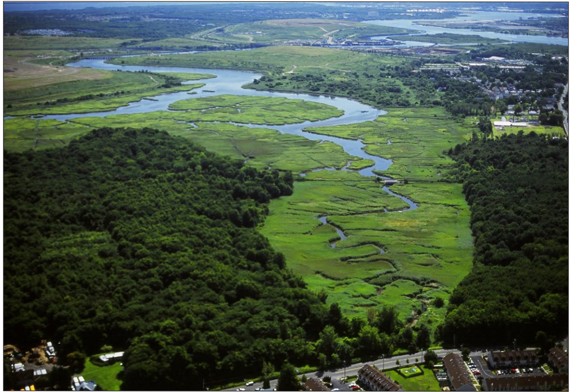
William T. Davis Wildlife Refuge 35