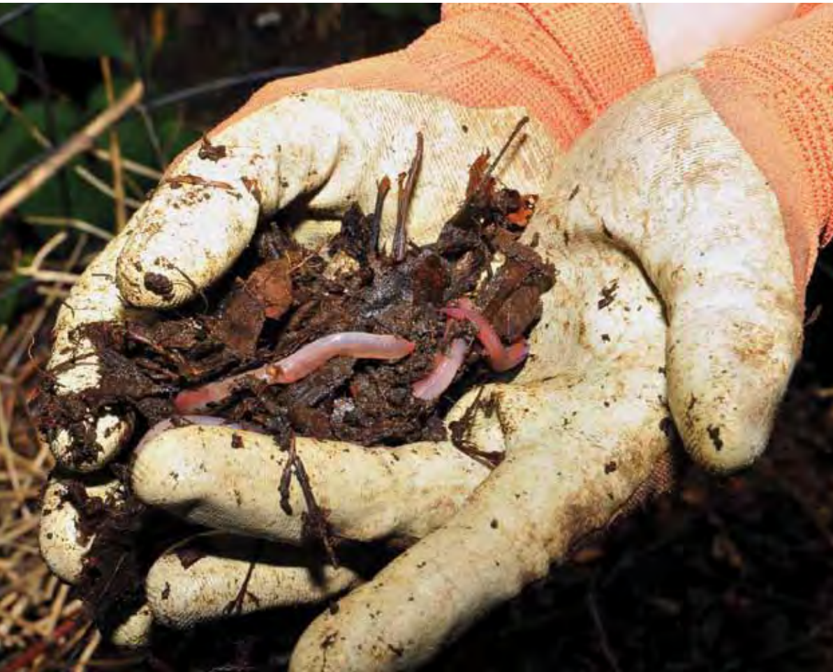
Compost is a waste product of worm digestion.