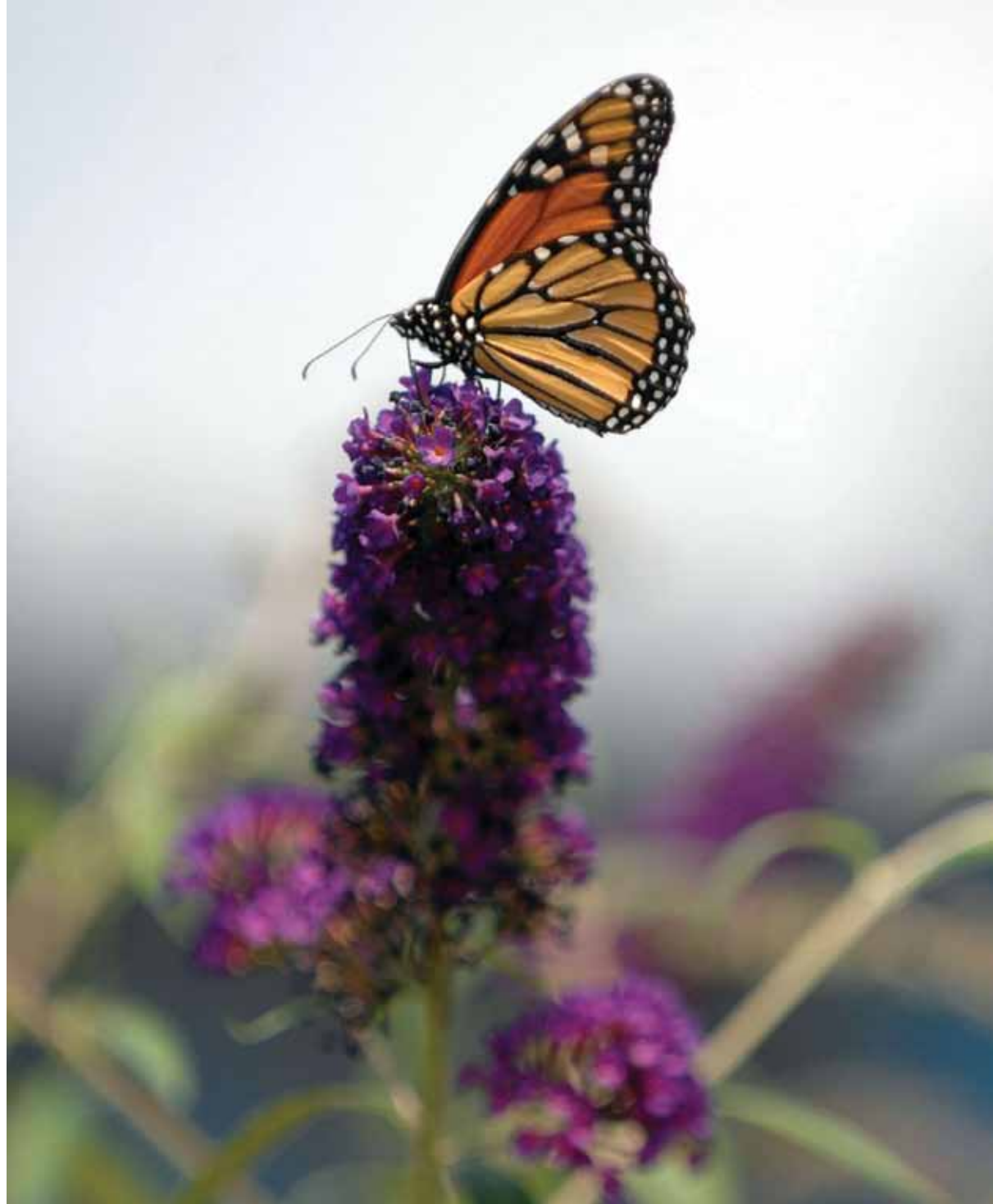
Hunt's Point Riverside Park, the Bronx.