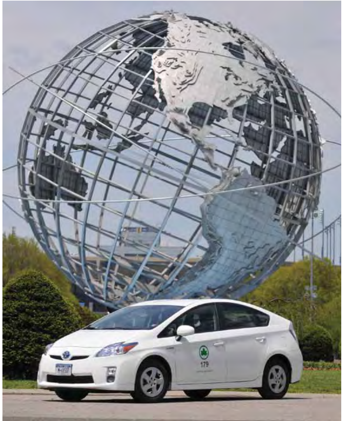
A Fuel efficient Parks vehicle at Flushing Meadows Corona Park in Queens.

We have introduced either B20 or B5 biodiesel at all 134 of our facilities. We will transition to using B20 exclusively over the next two years. We will also address maintenance concerns in older heating oil tanks. To ensure that heat and electricity are used efficiently, we have taken aggressive steps to weatherize our facilities, install efficient lighting, upgrade boilers, and paint our facility roofs white to reduce the urban heat island effect. All these efforts have already enabled Parks to reduce its carbon emissions from heating by 57% since FY 2008. Working with the City's Division of Energy Management and Parks' new Energy Manager, we will take steps to further improve the efficiency of our facilities through capital improvements and education for staff.