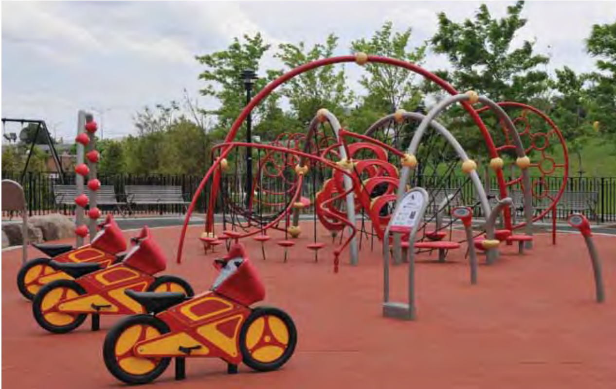
Children pedal stationary bikes to generate electricity and power nearby lighting.