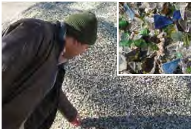
A park designer examines recycled glass fill, which was used as the basis for new pavement at Pearly Gates Park in the Bronx.

New York City's park system has long been both a paradigm and trendsetter for urban park systems around the world. Thanks to generous funding commitments from Mayor Bloomberg and the City Council, as well as the creation of Mayor Bloomberg's PlaNYC sustainability plan, Parks has been engaged in the greatest period of park building in New York City since the 1930s. The agency's capital design and construction staff engages in more than 100 projects each year. The current expansion and renovation of our parks system comes at a time when we have sharpened