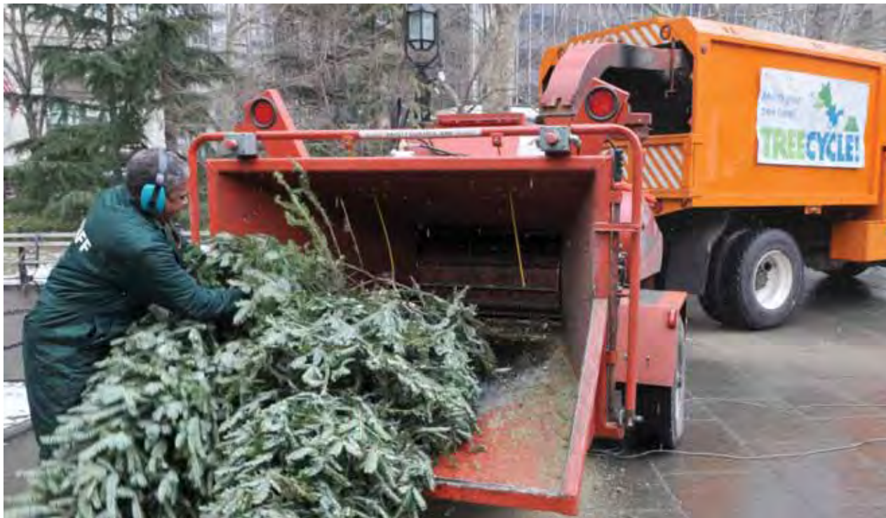
Above: Holiday trees are chipped into mulch at Mulch Fest 2011.

Parks has reduced vehicle and facility-related carbon emissions by 12% since 2007. Emissions from facility heating have been reduced by 57% since 2007.