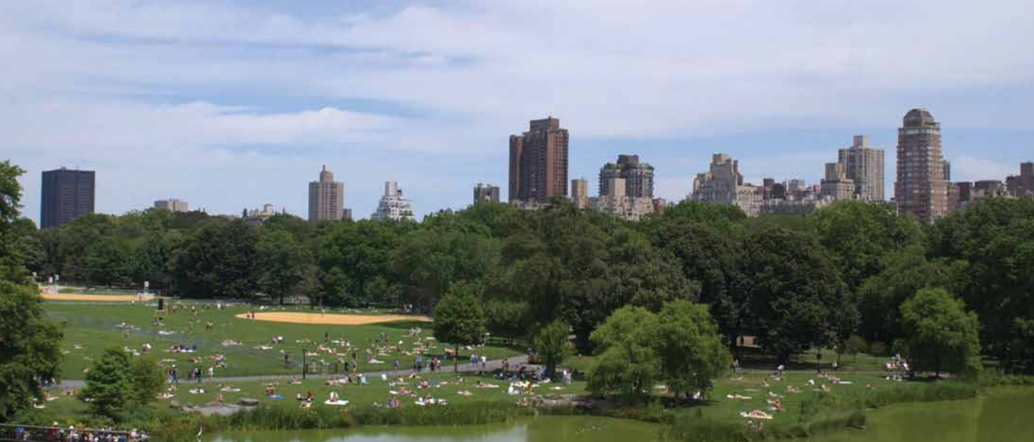
Central Park, Manhattan

Previous Page: A landscaped traffic median, or Greenstreet, at 1st Avenue and 20th Street.