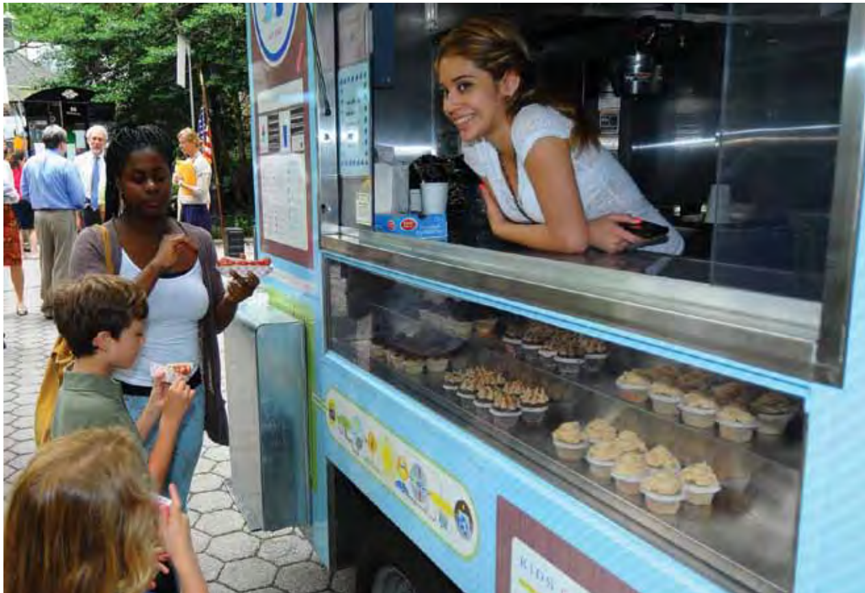
Prospective concessionaires must include a description of environmentally friendly practices planned for the concession.

Close to 500,000 trees have been planted by Parks and other partners since 2007 through the PlaNYC MillionTreesNYC initiative.