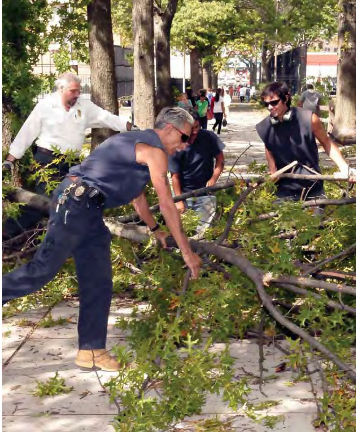
The September 16th 2010 tornadoes downed thousands of trees around the city. Photo Credit: Daniel Avila. Previous Page: The Harlem River Park bike path opened in April, 2010. Photo Credit: Daniel Avila.

Sustainable Parks will publish a progress update in early 2012 to evaluate our efforts and establish new goals where needed. The goals, milestones, and metrics, described in this Plan will guide our work and help track our progress. As we move farther along in the planning and implementation process, we will continue to solicit feedback from Task Force members as well as the broader Agency. Together, we are able to create a greener culture at Parks and in New York City, and affirm our commitment to being “NYC’s Greenest.”