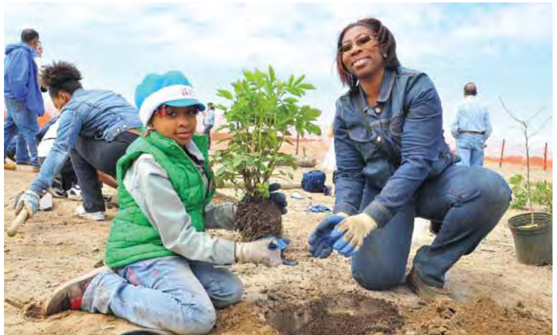
New Yorkers plant trees in Marine Park, Brooklyn, in April 2011.