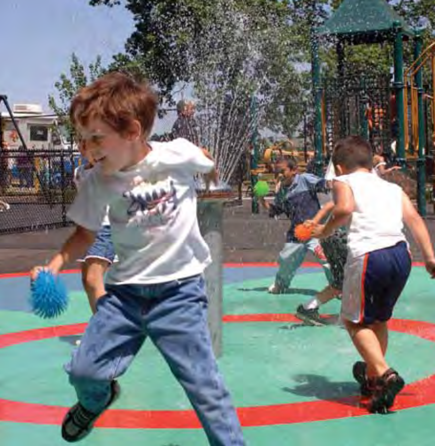
Kids cool down at a spray shower in Sweetgum Playground, Bronx.

design sessions through Partnership for Parks. Parks also contribute to the economic sustainability of New York City. Attractive parks can serve as economic lynchpins in neighborhoods, drawing visitors, businesses and residents, and boosting property values. Through the agency's partnerships, we encourage our non-profit partners and concessionaires to "go green." When selecting concessionaires that provide food and services in parks, we take their commitment to sustainable practice into consideration. Several job training programs run by Parks help create a greener workforce. Through the Parks Opportunity Program (POP), one of the nation's largest transitional employment programs, trainees gain skills related to energy efficiency and horticulture. In addition, The MillionTrees Training Program prepares par-