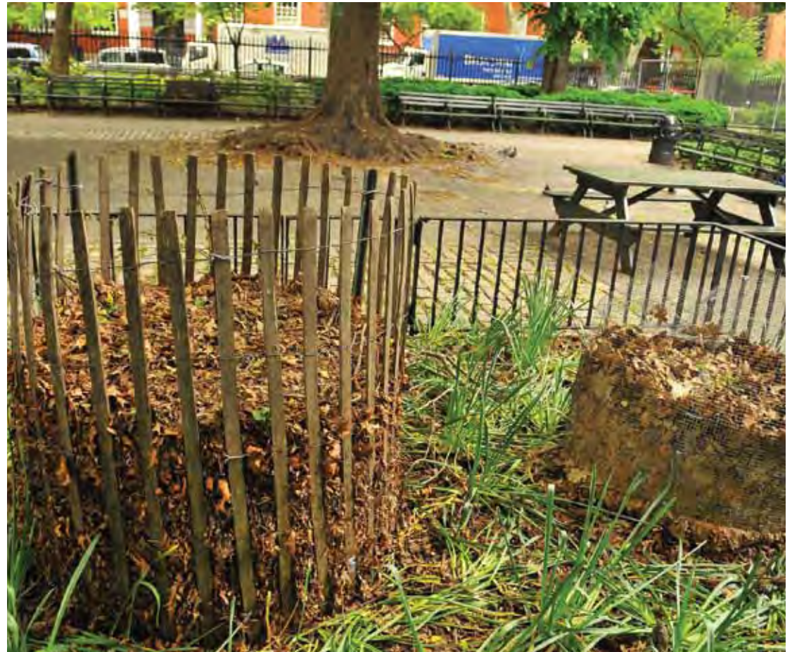
Small-scale composting at Stuyvesant Park, Manhattan.

Challenge: The leaves that blanket our lawns each fall are full of nutrients that over time can break down and nourish the soil if they are properly mulched. However, without mulching, leaves can suffocate the lawn below. For this reason, where we do not have composters, we have traditionally removed leaves from the lawns, which removes a natural nutrient source.