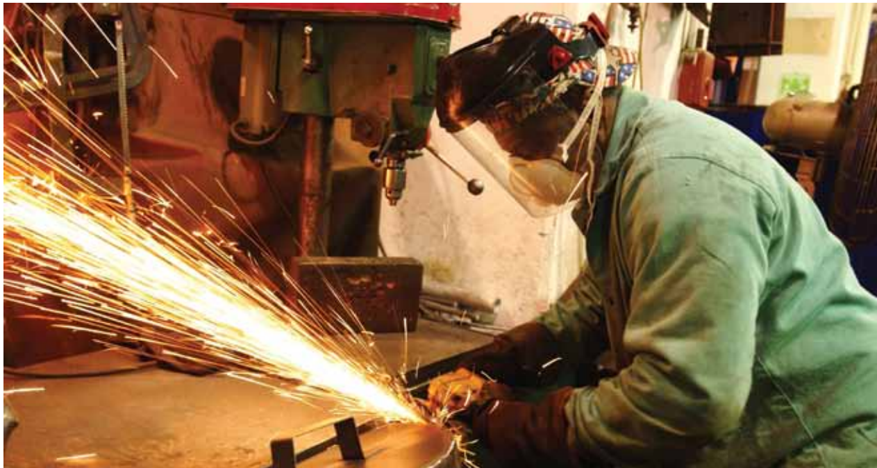
Above: A Parks blacksmith grinds the tub of a BBQ grill for a park.

Parks' diversity in human resources is matched by its variation in work environments. Employees work in both office and field settings, from sandy beaches and indoor ice rinks, to 18th century historical landmarks, WPA-era outdoor pools, and 21st century Leadership in Energy and Environmental Design (LEED)-certified buildings. Each setting presents a unique opportunity to minimize human impact on the environment. However,