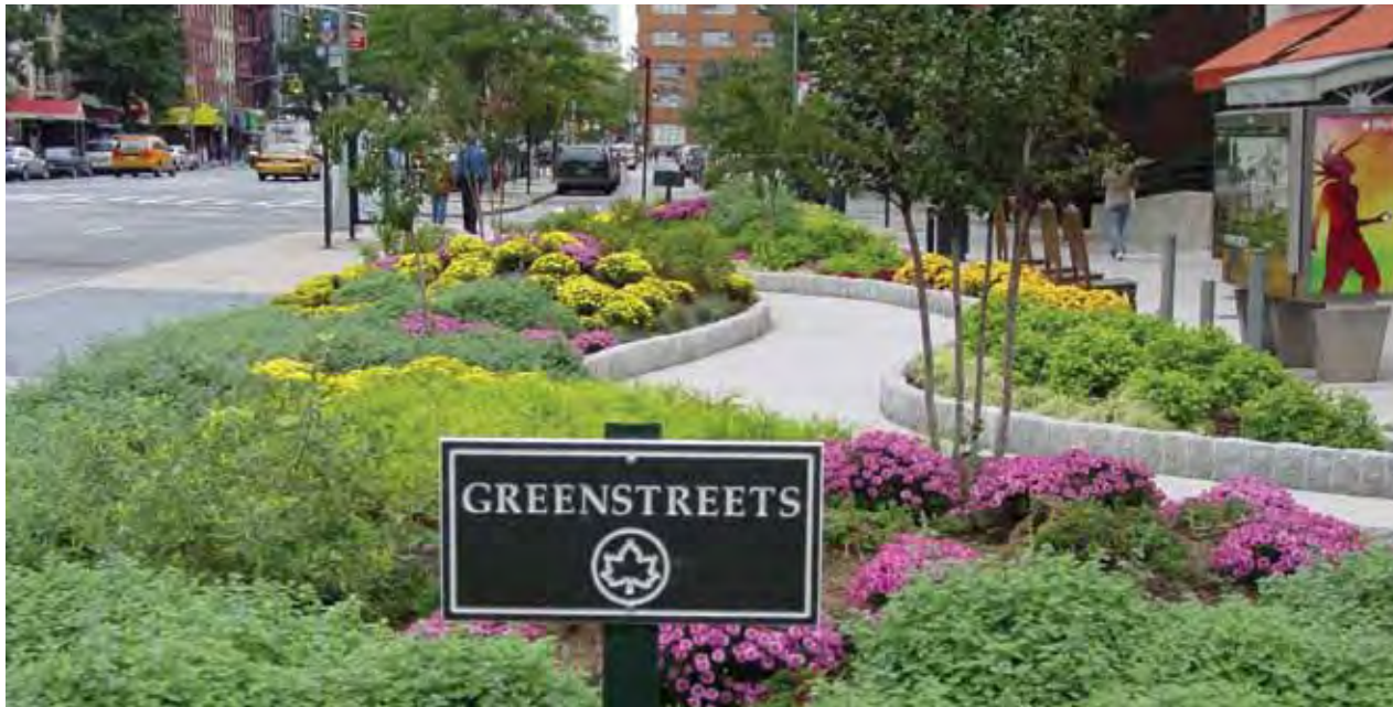
A landscaped traffic median, or Greenstreet, captures stormwater runoff at 1st avenue and 20th street in Manhattan.

Parks' Job Training Participants have weatherized over 200 comfort stations through insulating, caulking and sealing, making them more energy efficient.