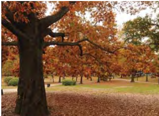
The city's 5.2 million trees drop vast quantities of leaves each fall, many of which can be mulched in place.