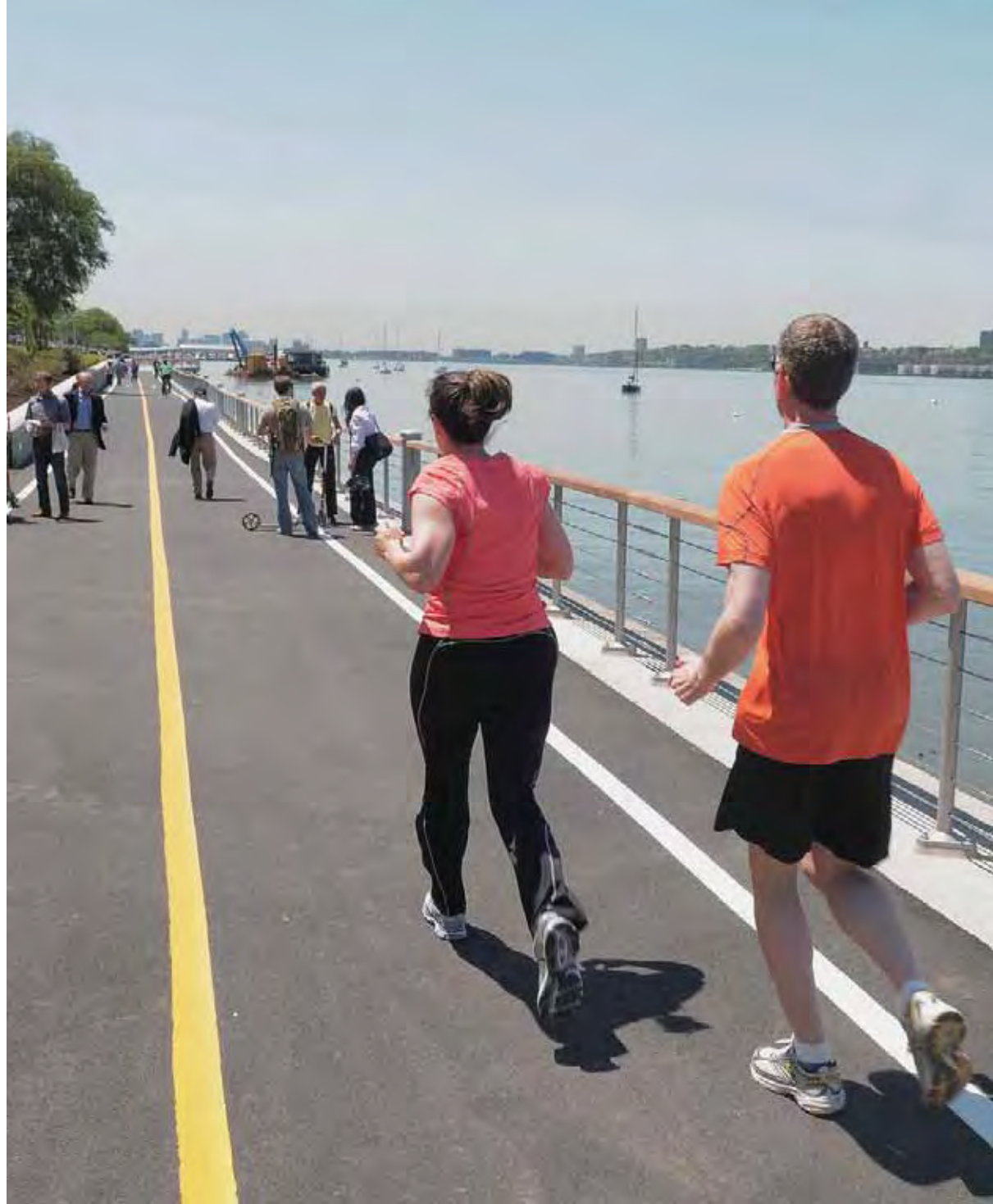
A path from West 83rd to West 91st Streets opened in May 2010. With the opening of this greenway section, New Yorkers can bike, jog and skate continuously along the Hudson River from Battery Park to Dyckman Street.