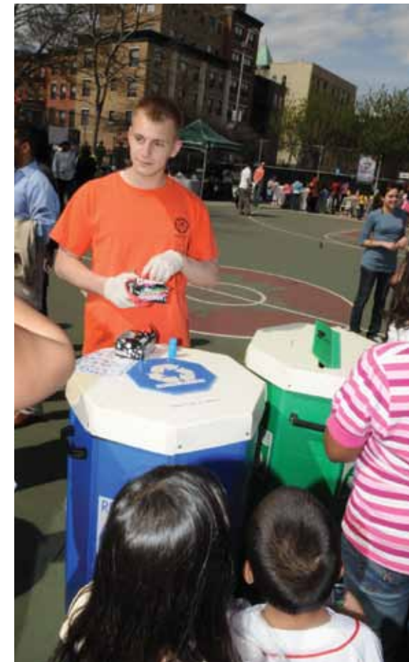
Recycling at the 2009 Street Games event in Thomas Jefferson Park, Manhattan.