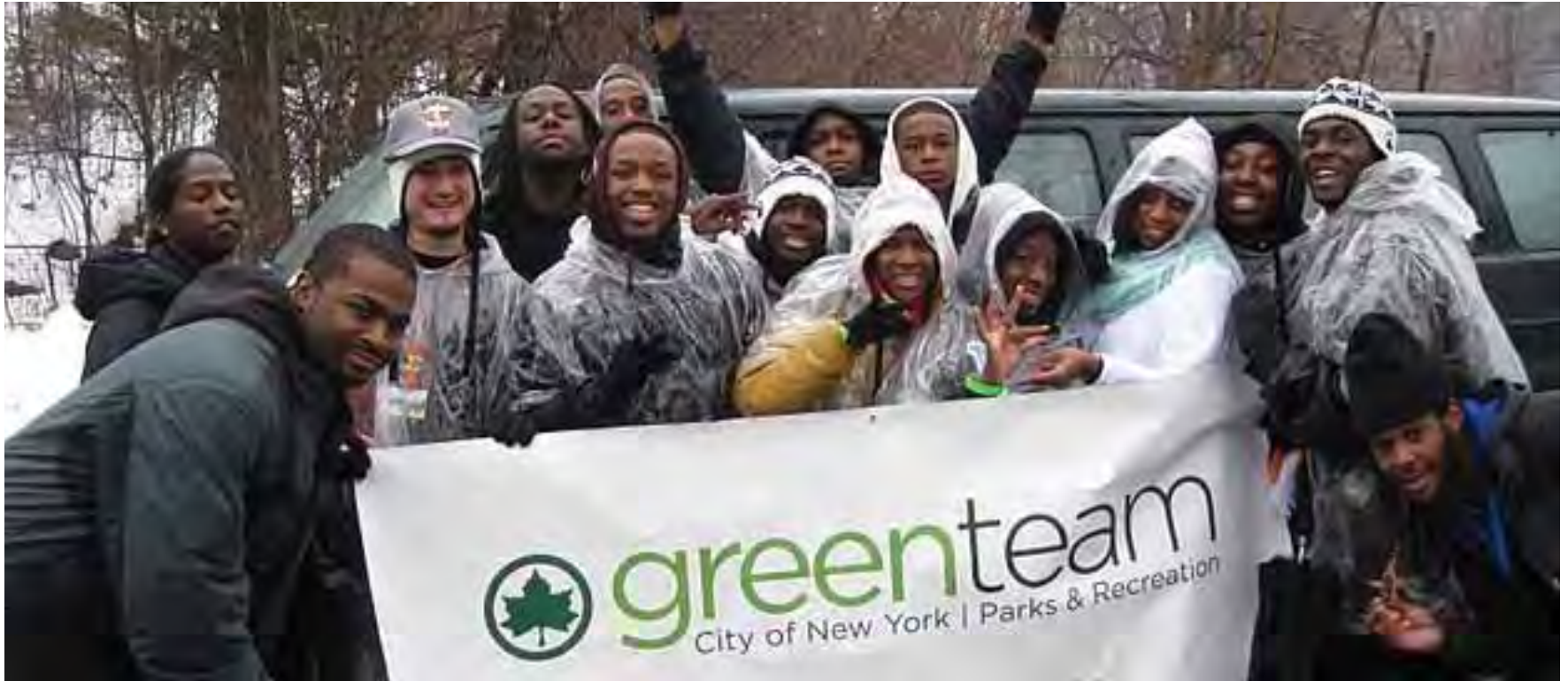
GreenTeam volunteers at the 2011 Winter Jam in Prospect Park, Brooklyn.