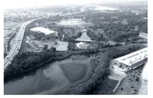
Snapshots of FMCP taken throughout the study