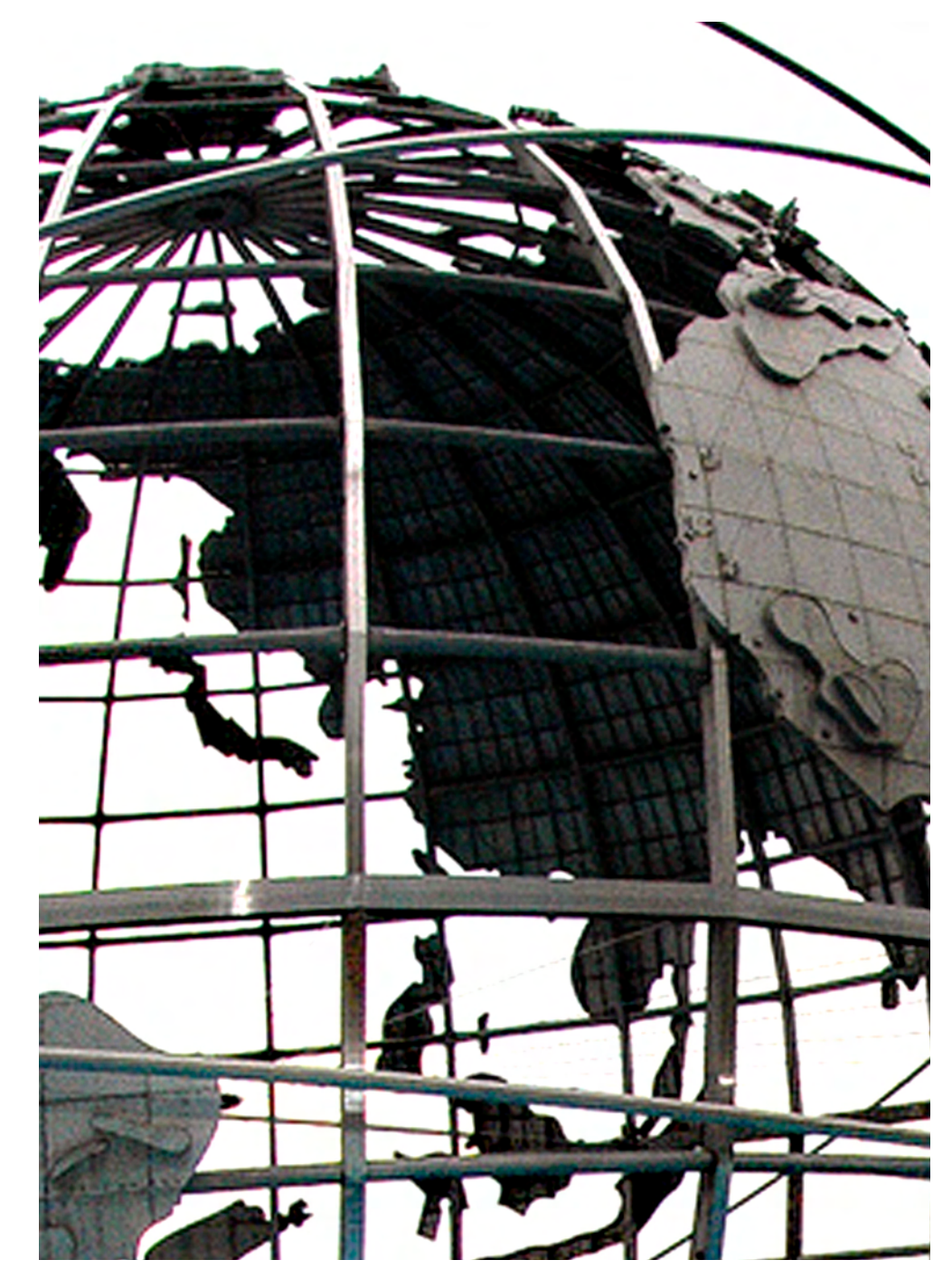
Unisphere - FMCP