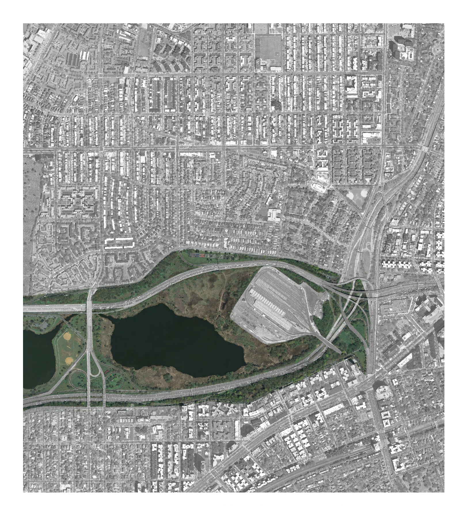
Aerial Photograph of FMCP ca. 2006.

Serving a large and diverse group of users, Flushing Meadows Corona Park (FMCP) is a public open space on a grand scale. The Park is an incredible resource with many remarkable assets, but it has not realized its potential in many respects.