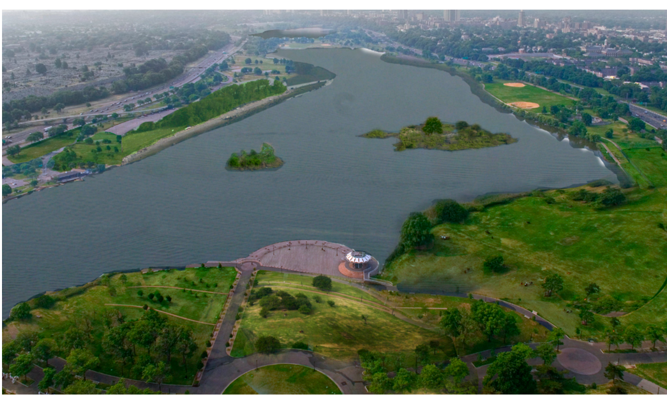
Reconfigured and Restored Lakes and a Re-envisioned World's Fair Core